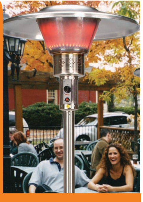
Portable Models: PHB1001 & PHB1003 Fixed Post Mount Model: PHB1004